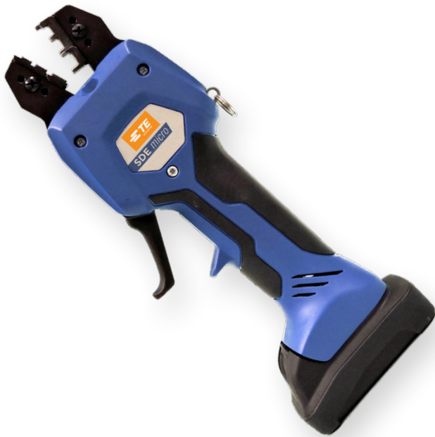
Lithium Battery Powered Crimping Tool